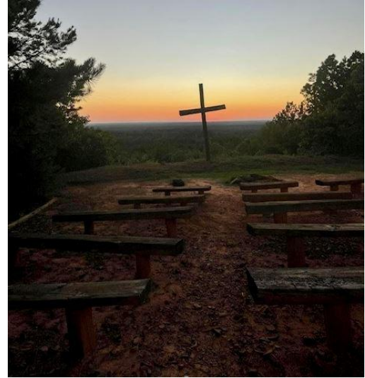
The Cross at Camp Gilmont