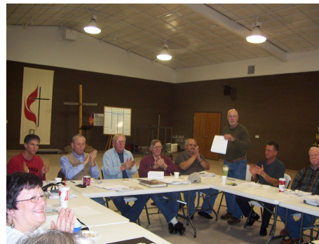
Changing of the guard: New and "old" board members

← DRIVING DIRECTIONS ARE AVAILABLE ON THE GRACEMMAUS.ORG WEBSITE