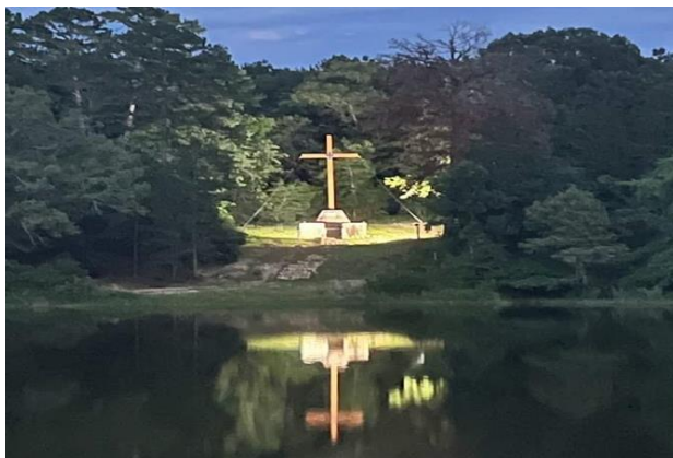
Cross at Disciples Crossing Camp