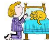
Get into the prayer habit.